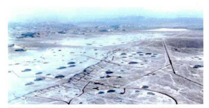
Weapons testing left this crater-scarred landscape at the Nevada Test Site.

The Nevada Test Site, covering 1,350 square miles (3,500 km²), was established in 1951. For four decades it was used to test nuclear weapons, until testing was banned in 1992.